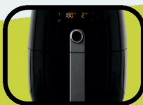
TALKING AIR FRYER