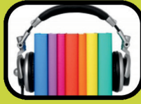
TALKING BOOK MACHINE